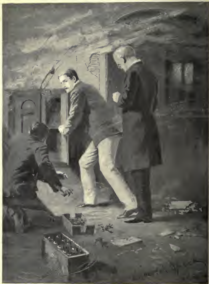
"I HAD THE SAFE BLOWN OPEN."—Page 163.